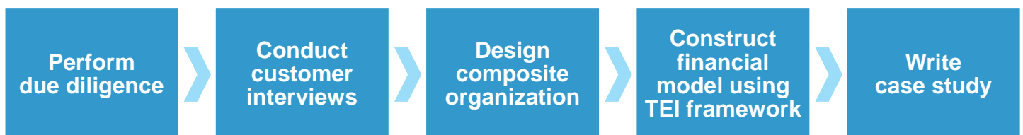
FIGURE 2 TEI Approach

Given the increasing sophistication that enterprises have regarding ROI analyses related to IT investments, Forrester's TEI methodology serves to provide a complete picture of the total economic impact of purchase decisions. Please see Appendix A for additional information on the TEI methodology.